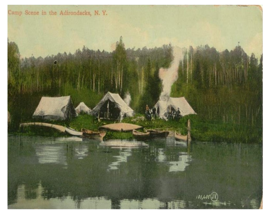
This post card was mailed on August 28, 1913 and postmarked at Saranac Lake, NY Fishing Camp on Saranac Lake

Sept 23-24, 2016 Decatur Alabama 2016 Region #3 Fall Show